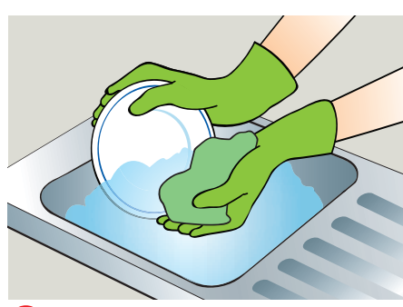
Immerse items for 5 minutes. Agitate/wipe as required to remove soiling.