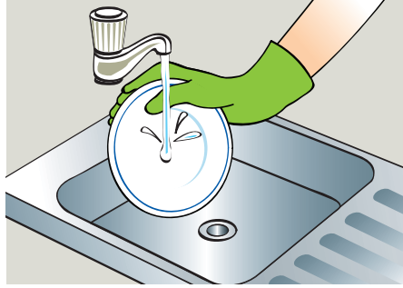
Rinse items thoroughly with clean water.