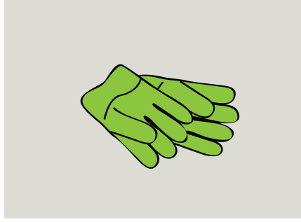
Use appropriate PPE as indicated in the Safety Data Sheet.