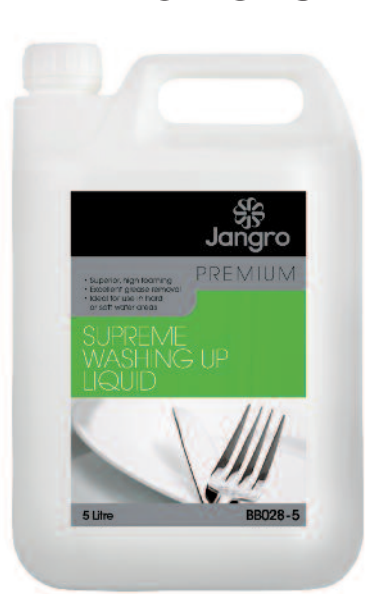
Crockery & Utensils