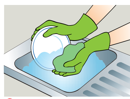
Immerse items for 5 minutes. Agitate/wipe as required to remove soiling.