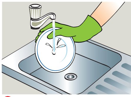
Rinse items thoroughly with clean water.