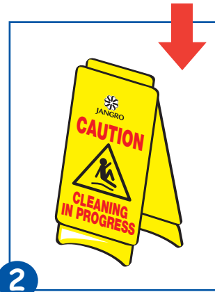
2 Place Safety Signs.