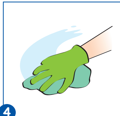
4 Wipe surface.