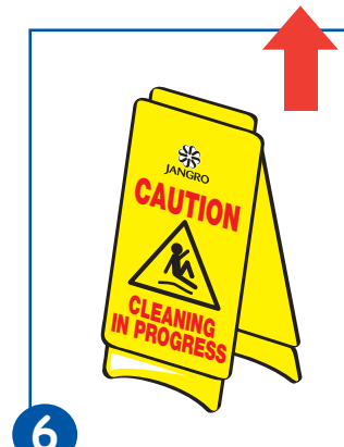
6 Remove Safety Signs.

Health & Safety Please refer to relevant COSHH Sheet.