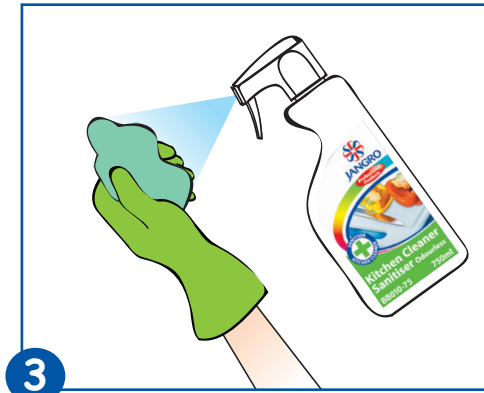
3 Spray solution onto cloth.