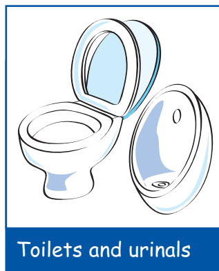
Toilets and urinals